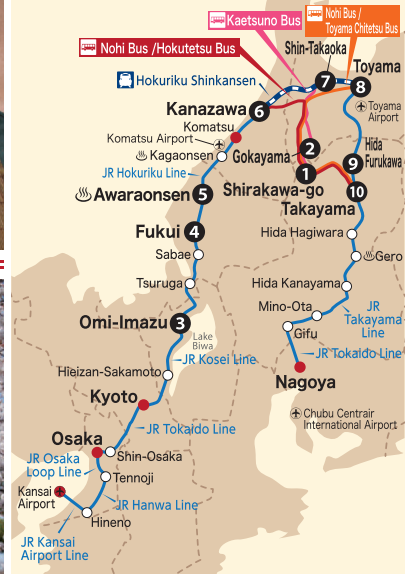
Image of usable routes of JR train, bus and sightseeing spots. Separate admission and access fees to the attraction shown in the diagram may be required.

✓ Use of reserved seats on ordinary trains of JR conventional lines are free of charge up to 4 times! (Excluding Limited Express "HARUKA") Unlimited rides on Hokuriku Shinkansen (non-reserved seats) between Kanazawa -Toyama!